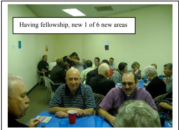
Having fellowship, new 1 of 6 new areas