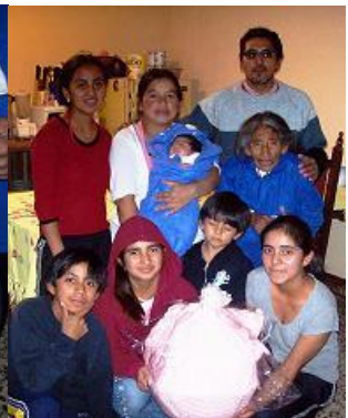
Most of the Family

Thank you so much for all you do bless the people of Guatemala who give thanks to God for your faithfulness.