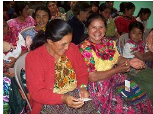
The women enjoy their gifts (heart bracelets).